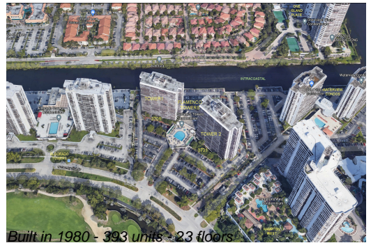
Built in 1980 - 393 units - 23 floors

The above valuated price is a baseline figure that does not take into account any specific renovation, upgrade, split, merge, or deterioration of the unit.