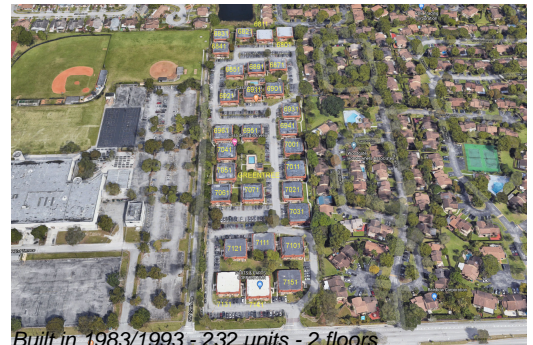
Built in 1983/1993 - 232 units - 2 floors