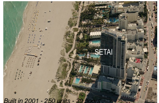
Built in 2001 - 250 units - 39 units for sale