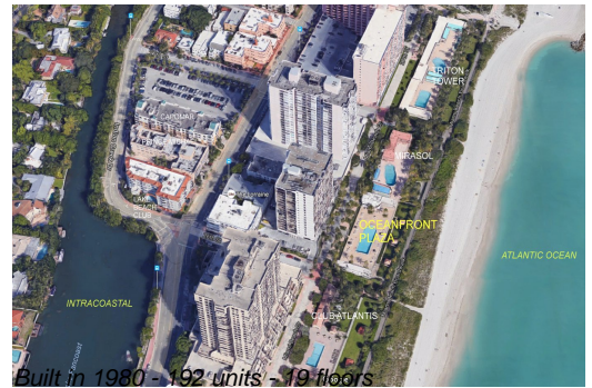
Built in 1980 - 192 units - 19 floors