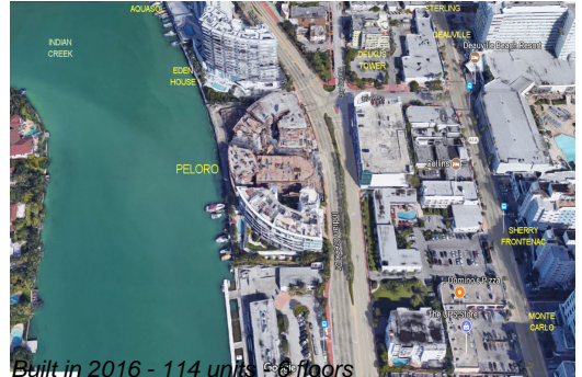
Built in 2016 - 114 units, 16 floors