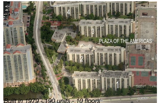
Built in 1979 - 190 units - 10 floors