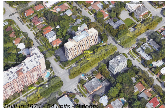
Built in 1974 - 54 units - 9 floors