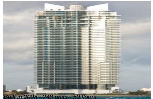
Built in 2008 - 248 units - 50 floors