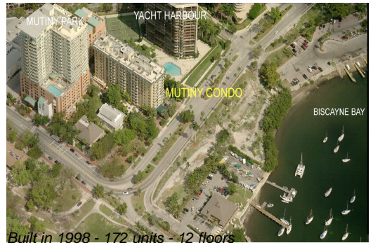
Built in 1998 - 172 units - 12 floors