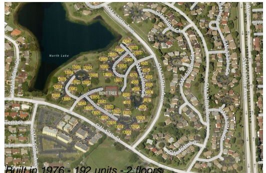
Built in 1976 - 192 units - 2 floors