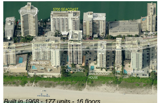
Built in 1968 - 177 units - 16 floors