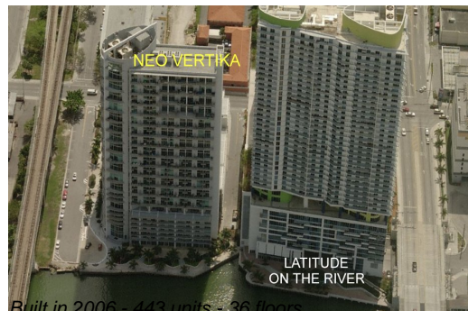
Built in 2006 - 443 units - 36 floors