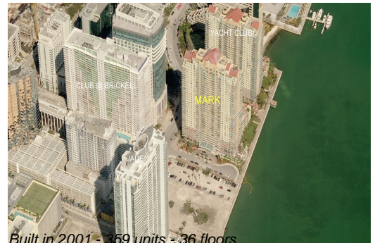
Built in 2001 - 359 units - 36 floors