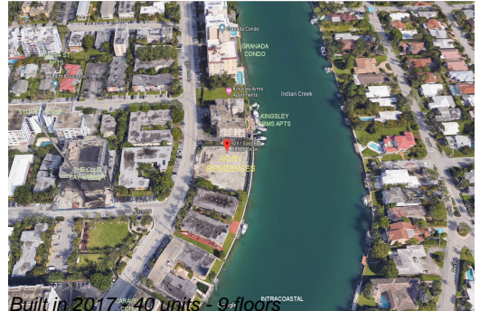
Built in 2017 - 40 units - 9 floors