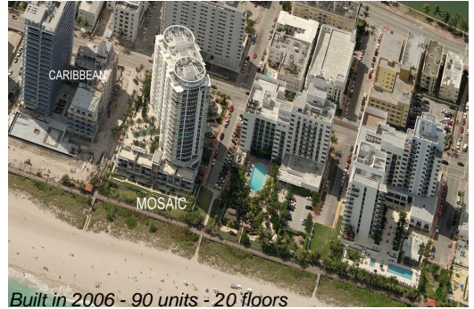
Built in 2006 - 90 units - 20 floors