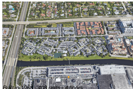
Built in 1968 - 408 units - 4 floors