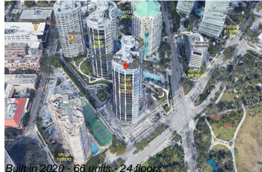
Built in 2020 - 66 units - 24 floors