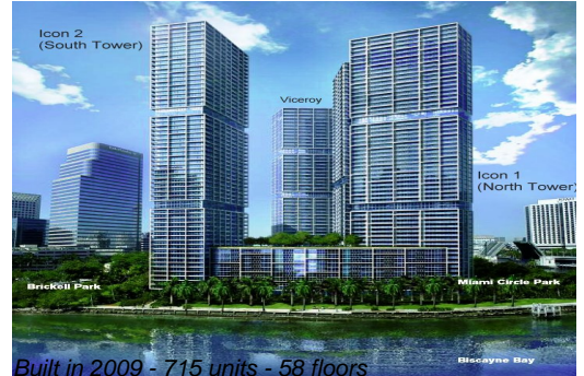
Built in 2009 - 715 units - 58 floors