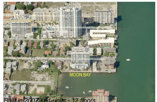
Built in 2007 - 61 units - 12 floors