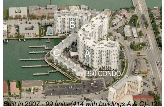
Built in 2007 - 99 units (414 with buildings A & C) - 12 floors