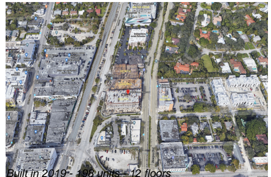
Built in 2019 - 198 units - 12 floors