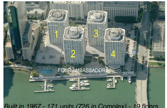
Built in 1967 - 171 units (726 in Complex) - 19 floors