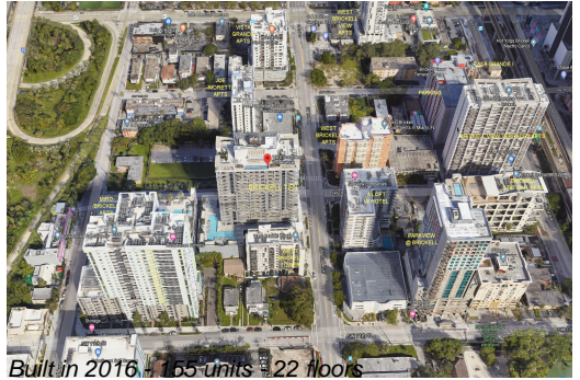
Built in 2016 - 165 units - 22 floors