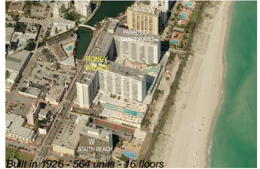
Built in 1926 - 564 units - 16 floors