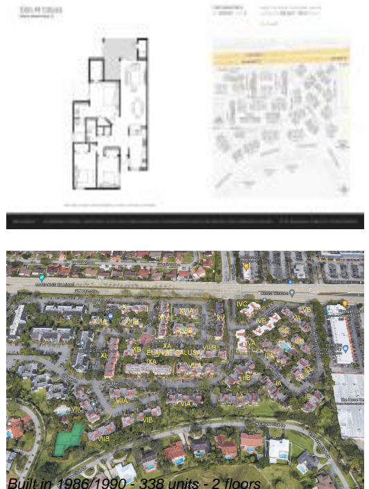
Built in 1986/1990 - 338 units - 2 floors