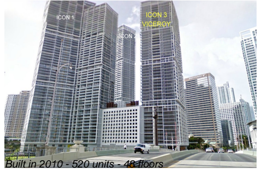
Built in 2010 - 520 units - 48 floors