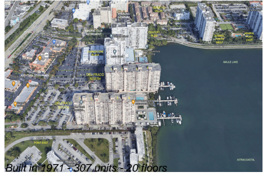
Built in 1971 - 307 units - 20 floors

The above valuated price is a baseline figure that does not take into account any specific renovation, upgrade, split, merge, or deterioration of the unit.