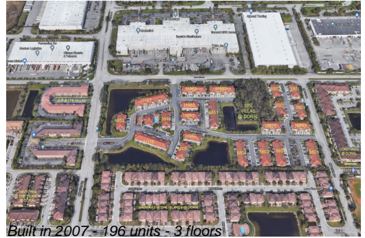
Built in 2007 - 496 units - 3 floors