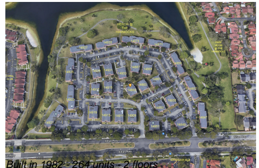
Built in 1982 - 264 units - 2 floors