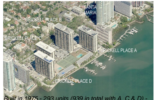
Built in 1975 - 293 units (939 in total with A, C & D) - 26 floors