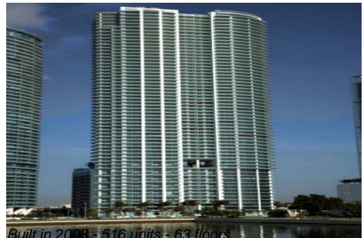
Built in 2008 - 516 units - 63 floors