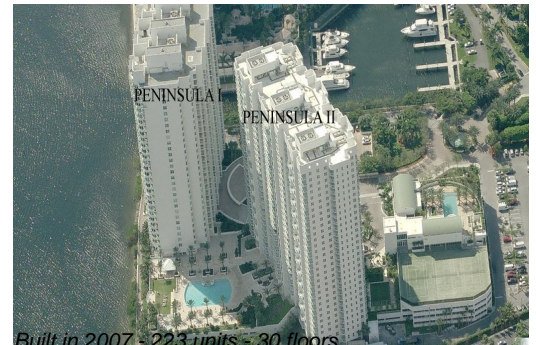
Built in 2007 - 223 units - 30 floors