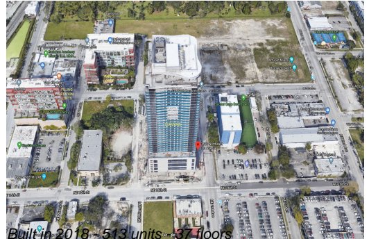
Built in 2018 - 513 units - 37 floors