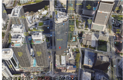
Built in 2018 - 439 units - 58 floors