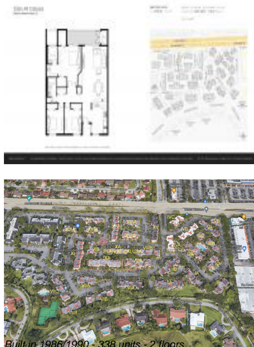
Built in 1986/1990 - 338 units - 2 floors