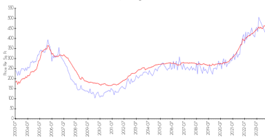
Grand View Palace vs North Bay Village