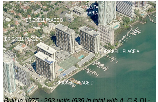
Built in 1975 - 293 units (939 in total with A, C & D) - 26 floors