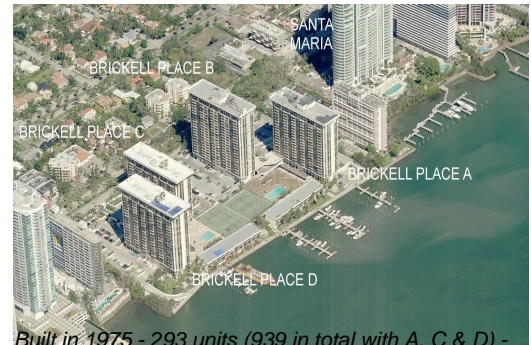
Built in 1975 - 293 units (939 in total with A, C & D) - 26 floors