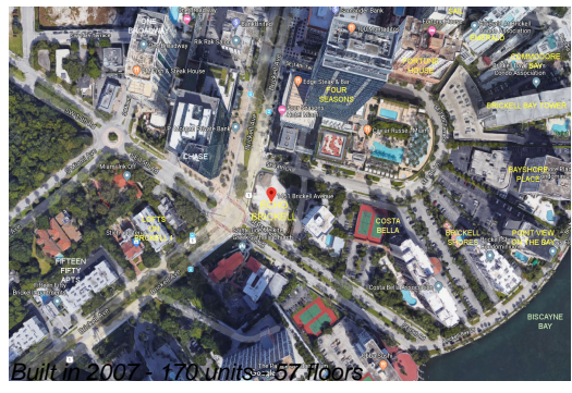
Built in 2007 - 170 units - 57 floors