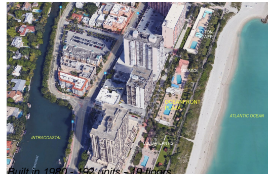
Built in 1980 - 192 units - 19 floors