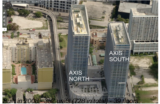
Built in 2008 - 352 units (726 in total) - 39 floors