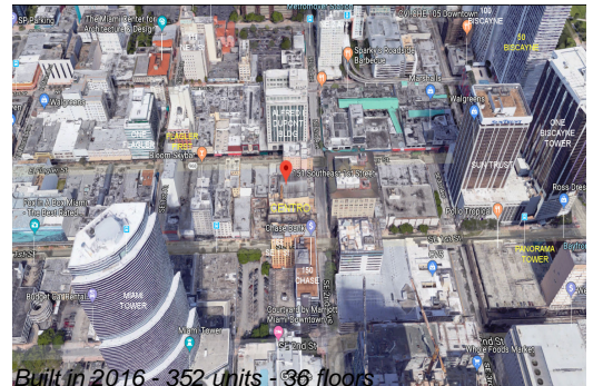
Built in 2016 - 352 units - 36 floors