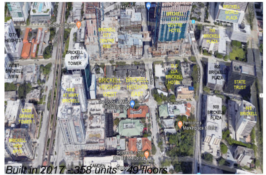
Built in 2017 - 358 units - 29 floors