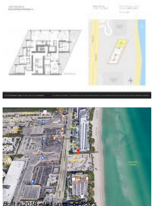
Built in 2018 - 191 units - 33 floors