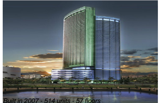
Built in 2007 - 514 units - 57 floors