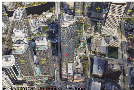
Built in 2018 - 439 units - 58 floors