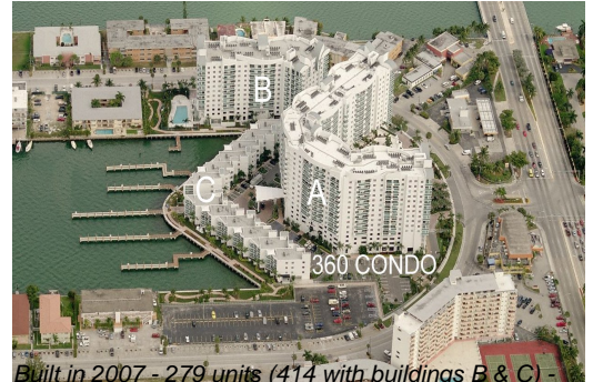
Built in 2007 - 279 units (414 with buildings B & C) - 15 floors