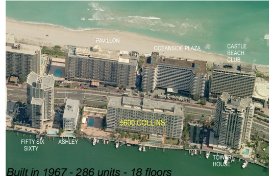
Built in 1967 - 286 units - 18 floors