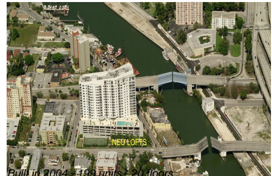
Built in 2004 - 199 units - 20 floors