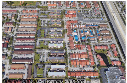
Built in 1988/90 - 312 units - 4 floors