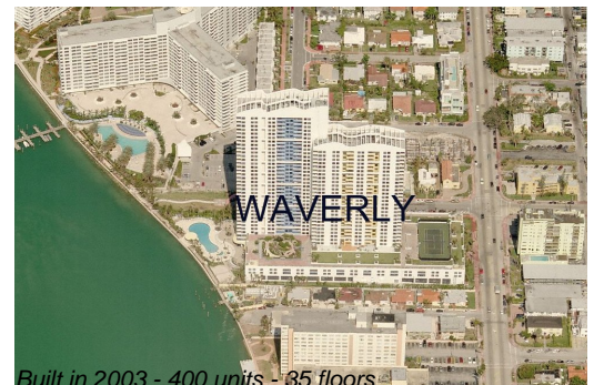
Built in 2003 - 400 units - 35 floors